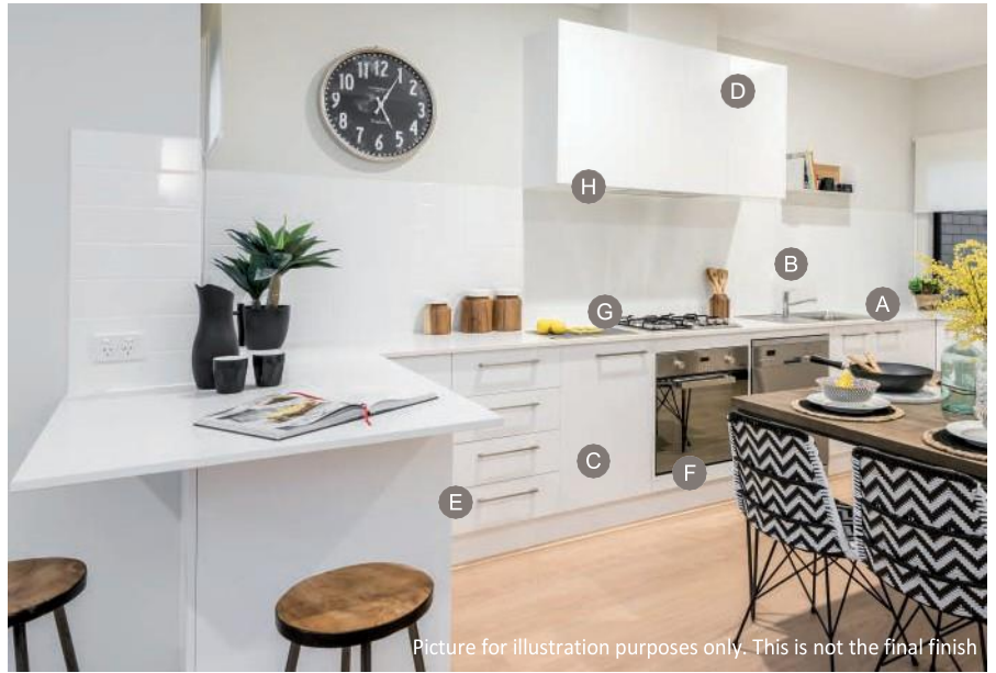
Picture for illustration purposes only. This is not the final finish