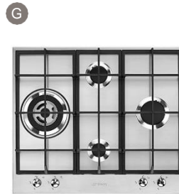
Bosch gas Cooktop