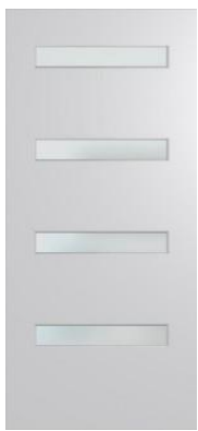
Front door External

Colorbond Downpipes to match fascia Colorbond metal fascia & gutters, color as agreed by developer and council