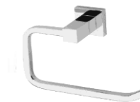
Toilet Roll Holder